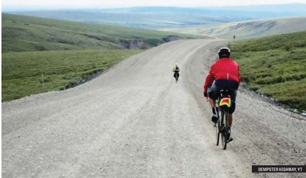
DEMPSTER HIGHWAY, YT